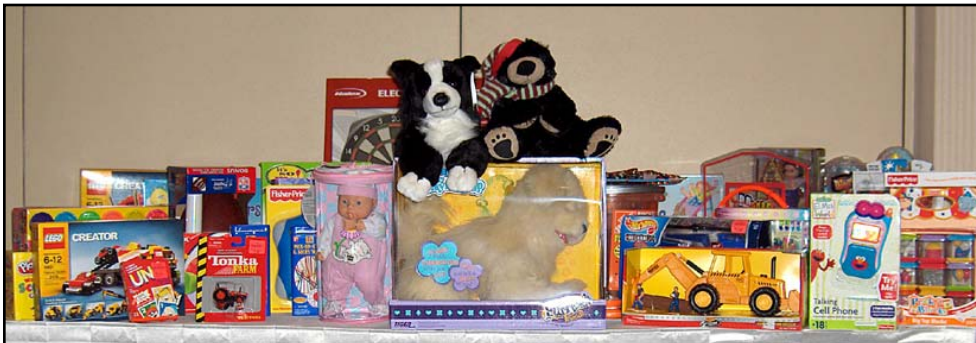
"Toys for Tots" Donations