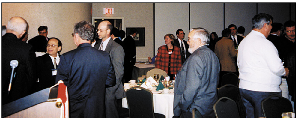
How many faces do you recognize?